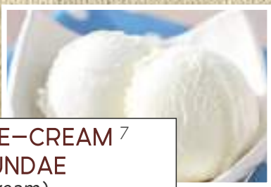
ICE-CREAM 7 SUNDAE (cream) € 3,50