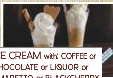
ICE CREAM with: COFFEE or CHOCOLATE or LIQUOR or AMARETTO or BLACKCHERRY € 7,00 3,6,7,8