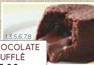
1,3,5,6,7,8 CHOCOLATE SOUFFLÈ € 5,00