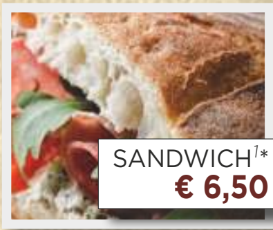
SANDWICH 1* € 6,50