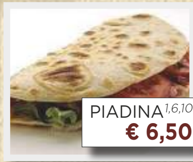
PIADINA 1,6,10 € 6,50