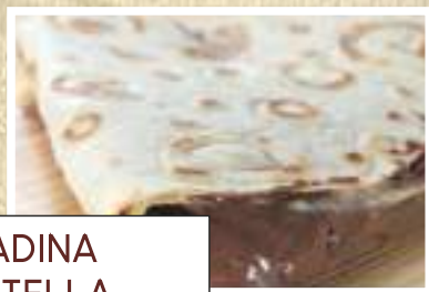
PIADINA NUTELLA € 6,00 6,7,8